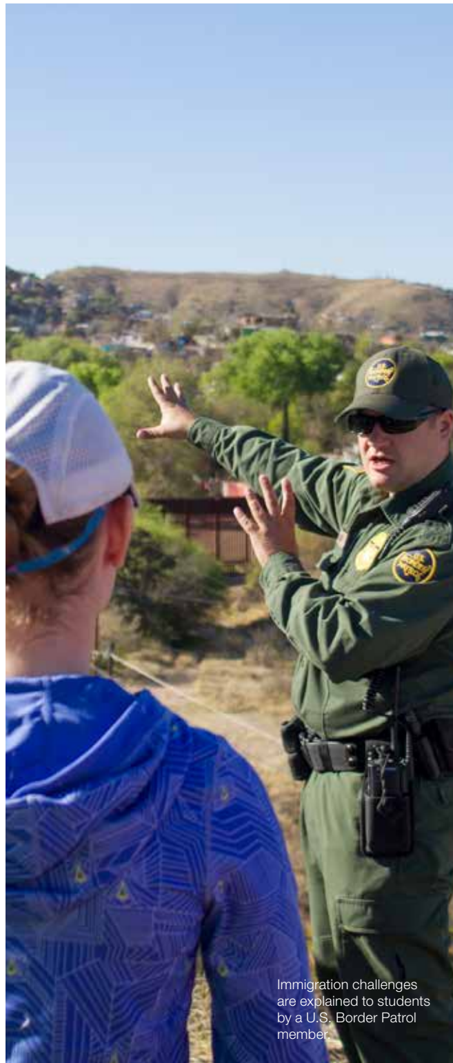
Immigration challenges are explained to students by a U.S. Border Patrol member.