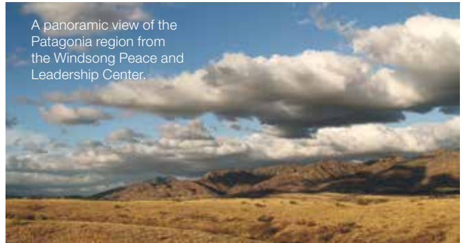
A panoramic view of the Patagonia region from the Windsong Peace and Leadership Center.