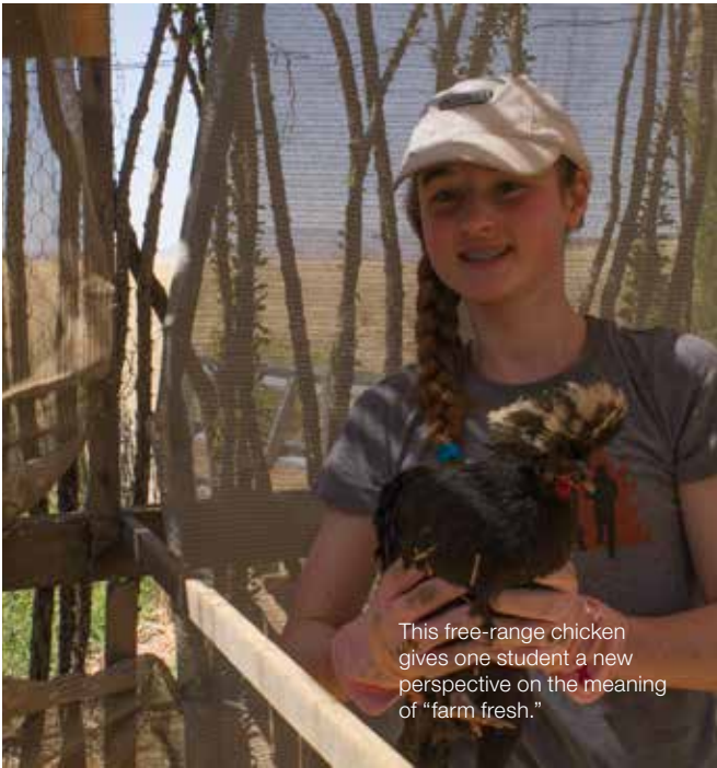
This free-range chicken gives one student a new perspective on the meaning of "farm fresh."