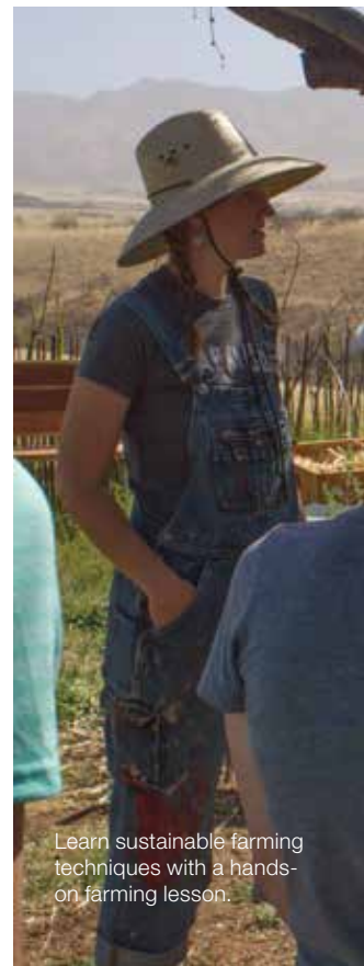
Learn sustainable farming techniques with a hands-on farming lesson.