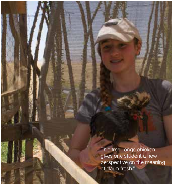
This free-range chicken gives one student a new perspective on the meaning of "farm fresh."