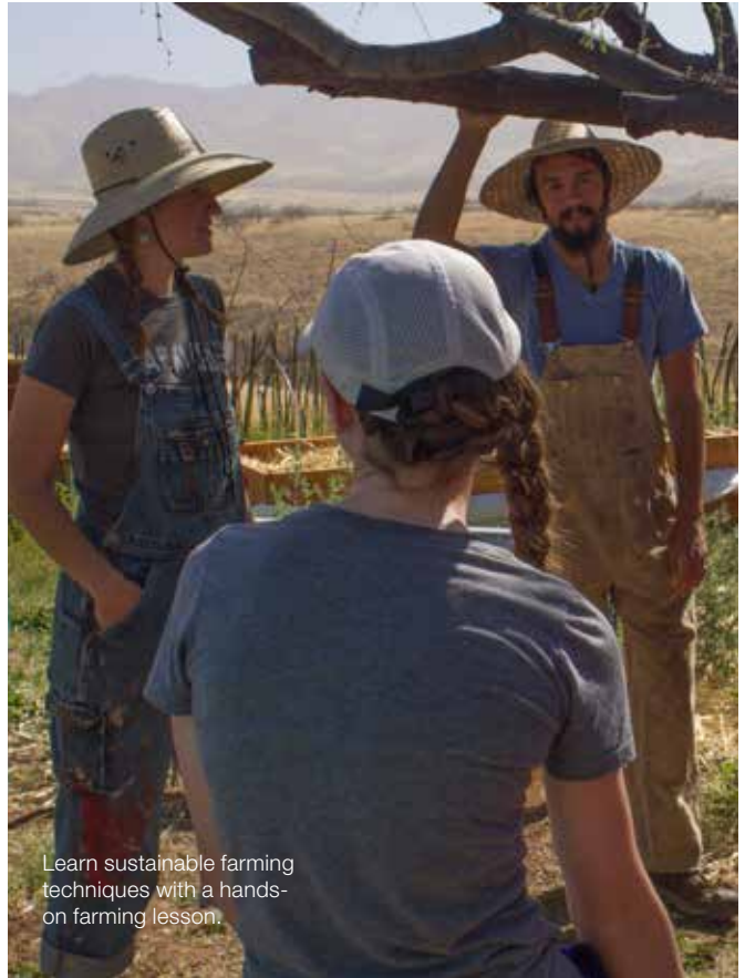
Learn sustainable farming techniques with a hands-on farming lesson.