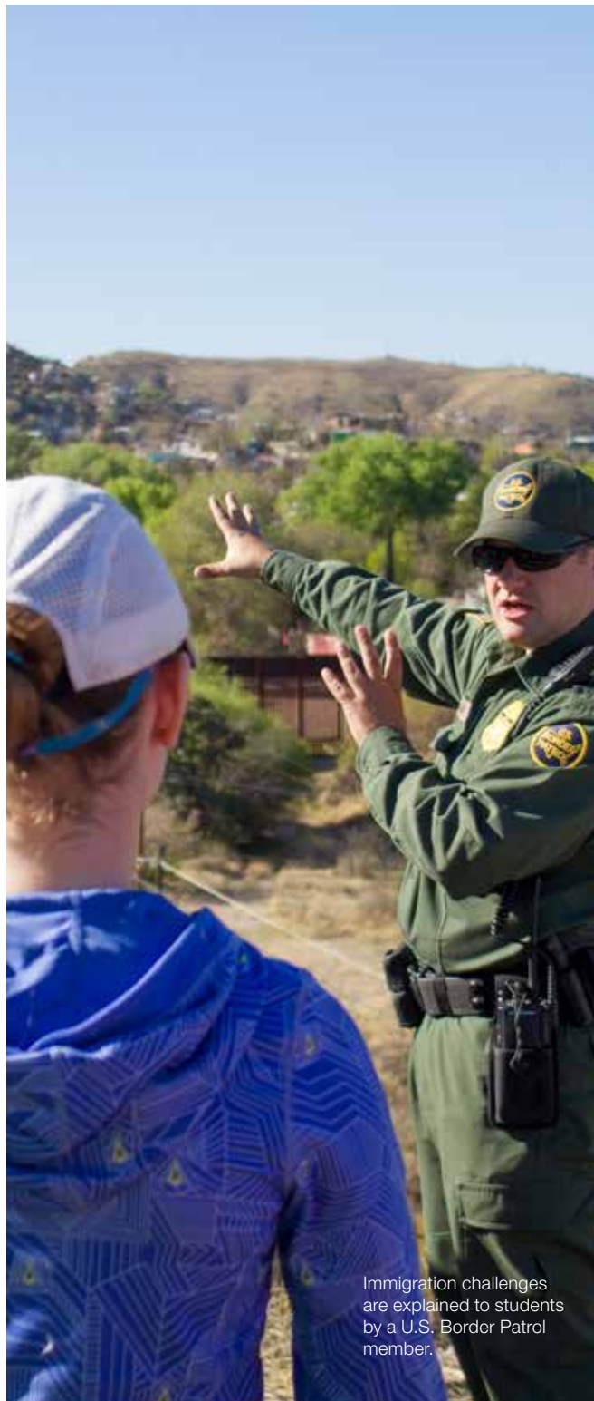
Immigration challenges are explained to students by a U.S. Border Patrol member.