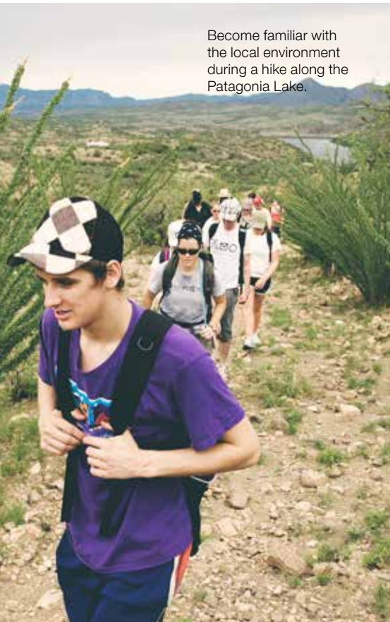
Become familiar with the local environment during a hike along the Patagonia Lake.