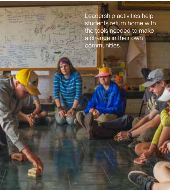
Leadership activities help students return home with the tools needed to make a change in their own communities.