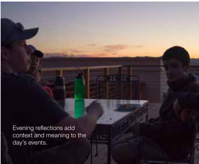
Evening reflections add context and meaning to the day's events.