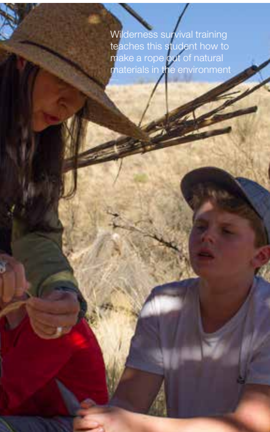
Wilderness survival training teaches this student how to make a rope out of natural materials in the environment