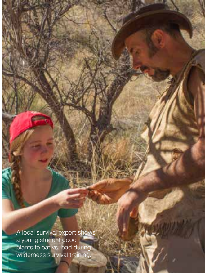
A local survival expert shows a young student good plants to eat vs. bad during wilderness survival training.