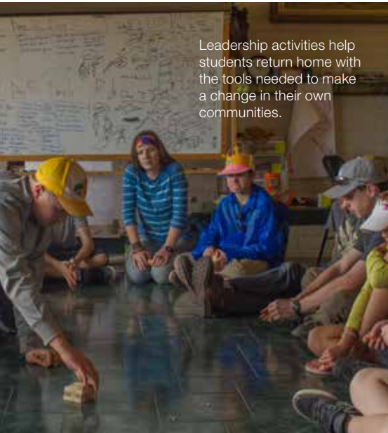
Leadership activities help students return home with the tools needed to make a change in their own communities.